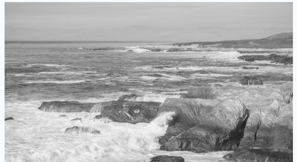
San Luis Obispo County is 3,300 square miles